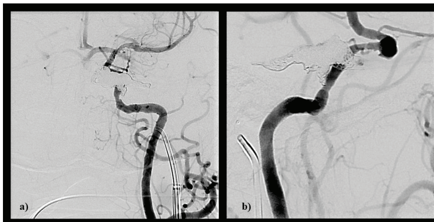
Fig. 2. Intraoperative imaging: a) intraprocedural DSA showing transvenous approach where the tip of 5F diagnostic catheter is in IPS and the microcatheter is in the cavernous sinus, which is in turn filled with coils (AP projection), and b) intraprocedural DSA showing transvenous approach where the tip of 5F diagnostic catheter is in IPS and the microcatheter is in the cavernous sinus which is in turn filled with coils (LL projection).