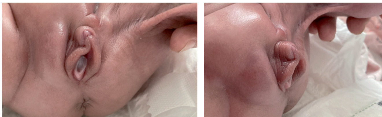
Figure 2. Regression of clitoromegaly at the age of 91 days (corrected gestational age 40 + 6 weeks)

17OHP – 17-hydroxyprogesterone; DHEAS – dehydroepiandrosterone sulphate; LH – luteinising hormone; FSH – follicle stimulating hormone; AMH – anti-Müllerian hormone