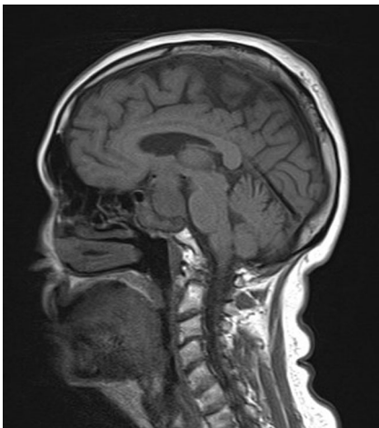
Fig. 1 Preoperative MR of the brain. Native sagittal T1-weighted imaging. An iso-intense mass lesion is occupying the sellar and suprasellar region. A mass lesion is present in the sphenoid sinus. Note the relatively clear border between the sellar and sphenoid lesion. The sellar and suprasellar lesion represents the pituitary macroadenoma. Mass lesion in the sphenoid sinus represents dense sphenoid mucosa with aspergilloma

macroadenoma was incidental. According to the MR finding, the preoperative assumption of possible sphenoid sinus aspergilloma was made in only one patient.