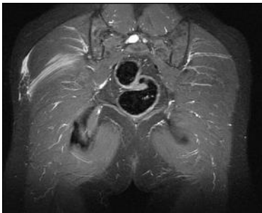
Fig. 4. MRI of the lumbosacral spine: transversal plane.