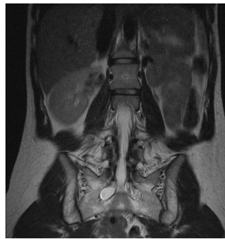
Fig. 5. MRI of the lumbosacral spine: coronal plane.