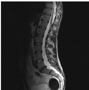
Fig. 3. MRI of the lumbosacral spine: sagittal plane; right-sided sacral S2 and S3 perineural cysts, the largest located at the right S2 nerve root.

Patient reported exacerbation of symptoms when standing, coughing and lifting. Later the patient started having rest pain as well. On clinical examination, distribution of the pain corresponded to the S2-S3 dermatome. Straight leg raising was 40° on the right side and normal on the left side. There was significant blunting of sensations along the S1 and S2 dermatome on the right side, with a slight motor deficit in right lower limb. X-ray of the lumbosacral spine did not reveal any abnormality. Magnetic resonance imaging (MRI) of the lumbosacral spine and hip showed right-sided, sacral S2 and S3 perineural cysts, the largest located at the right S2 nerve root (Figures 3-6). Note the resulting denervation edema in the right gluteal muscle.