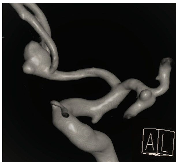
Fig. 2. Classifying the direction of aneurysm dome. After positioning the patient, with the head fixed in a dedicated mold, the machine arm was calibrated so that the patient's anterior skull base was parallel to the horizontal line on the anterior and profile planes of the DSA. Then, 3D DSA acquisition was performed, and data were transferred to an independent workstation. The direction of the aneurysm was determined according to projection cube on 3D DSA images in dedicated software (Leonardo Workplace; Siemens Healthcare, Erlangen, Germany).

erwise, numerical data were presented as median values with minimum and maximum values, and the Kruskal-Wallis test was used to compare numerical variables between different groups. Logistic regression was used to calculate the odds ratios and 95% confidence intervals (95% CI) for the likelihood of aneurysm rupture and each individual morphological and clinical characteristic. A 2-sided p < 0.05 was considered as statistically significant. Significant predictors were then used in a multiple logistic regression model. The false discovery rate was controlled using the Tukey (for parametric) and Benjamini-Hochberg (nonparametric) procedure for multiple testing. Statistical analyses and visualizations were done using the R language and environment for statistical computing, including the following additional packages: Hmisc, dplyr, compareGroups, finalfit 17-21 .